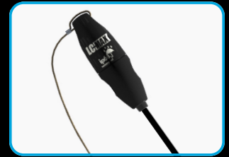
IP68 Cap & Tether